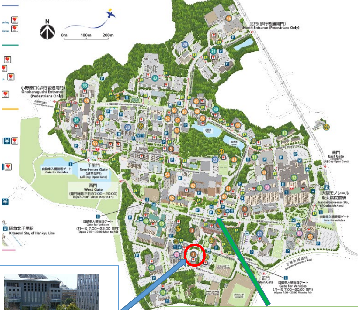
Suita campus map