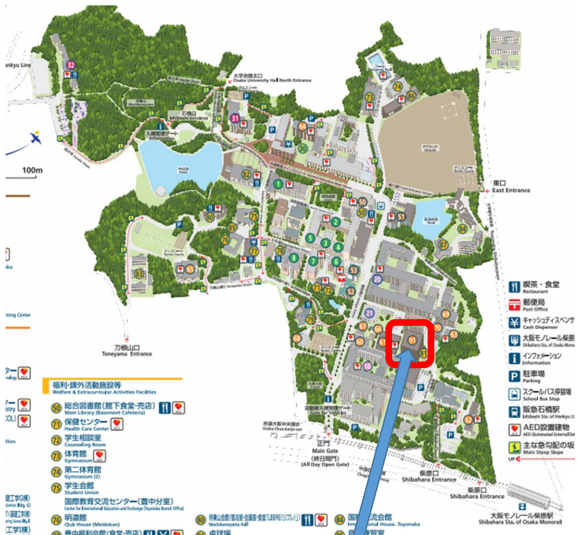
Toyonaka campus map

Interdisciplinary Research Building Located next to the convenient store “Lawson” (“Lawson” is close on that day)